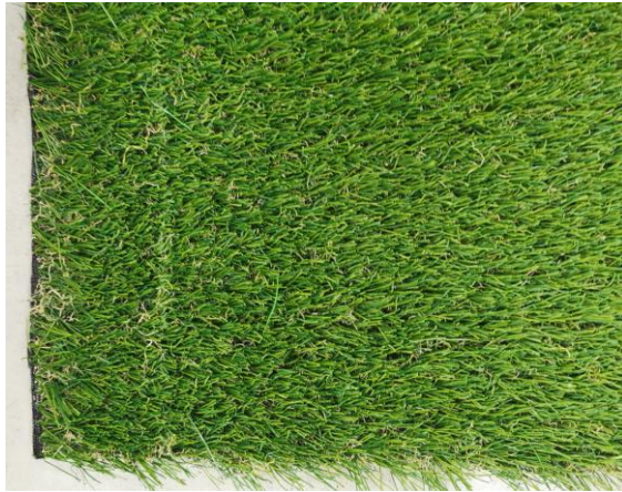
US00579 – Zoysia Turf face view