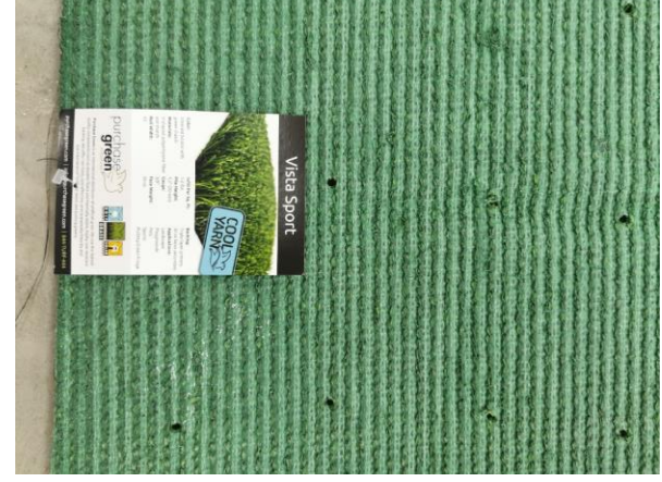
US00589 – Vista Sport Turf backing view