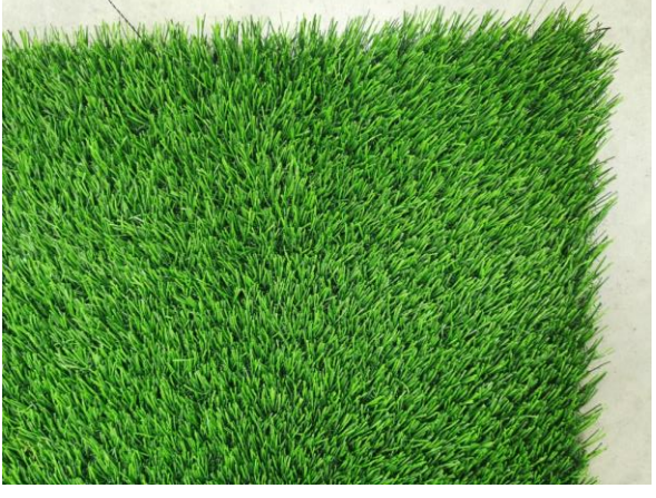
US00589 – Vista Sport Turf face view