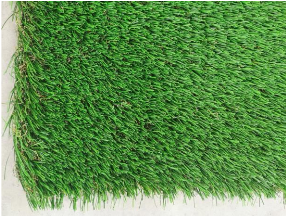
US00592 – Vista Natural 80 Turf face view