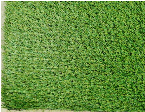
US00575 – Southwestern Sod Sport Turf face view