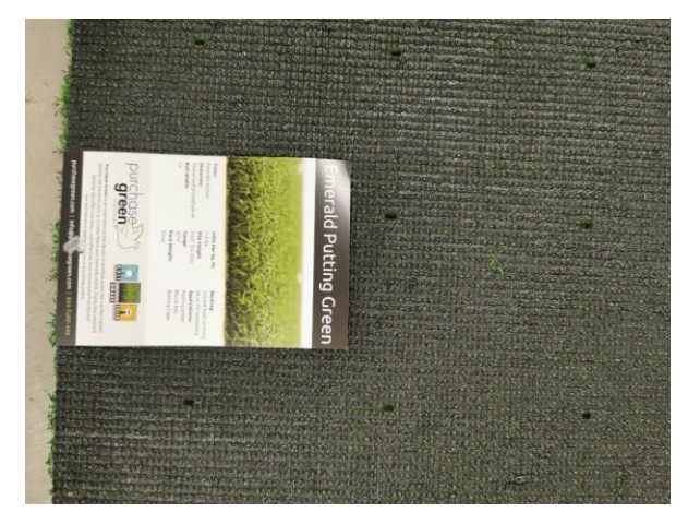
US00587 – Emerald Putting Green Turf backing view