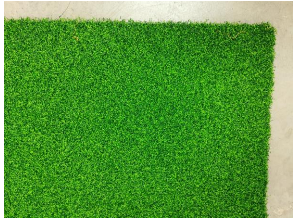
US00587 – Emerald Putting Green Turf face view