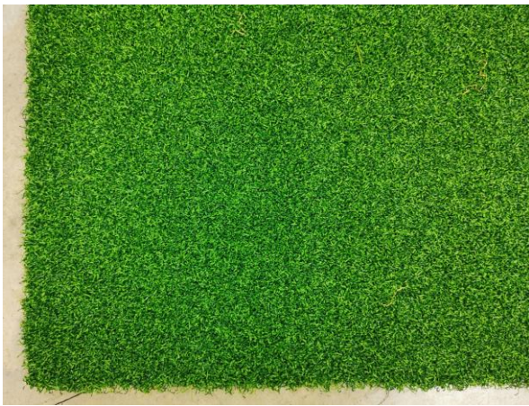
US00577 – Dark Olive Putting Green Turf face view