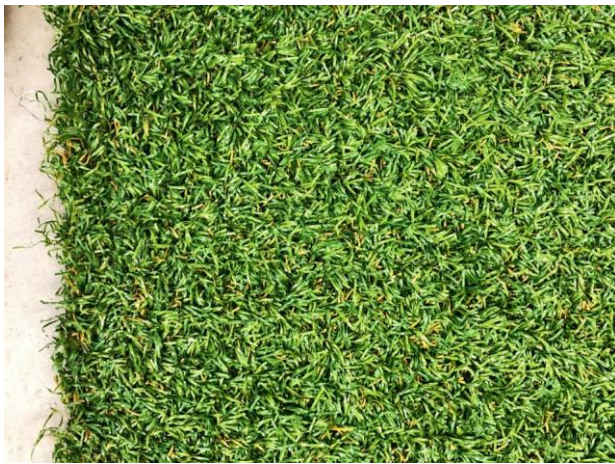
US00600 – PlayScape Pro Turf face view