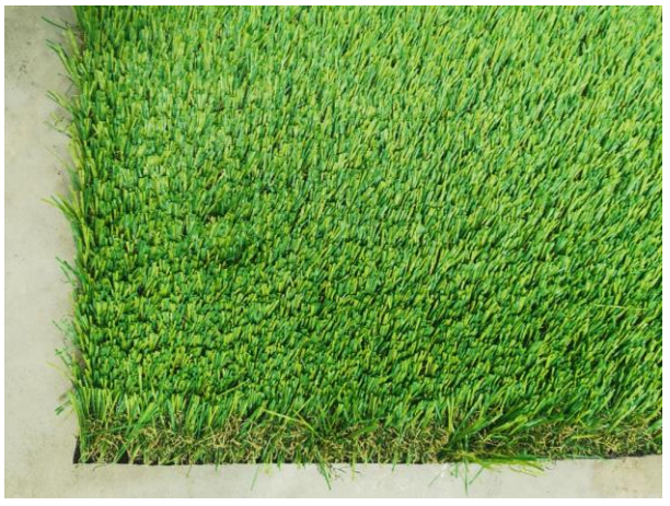
US00597 – Nature Sod Plush Turf face view