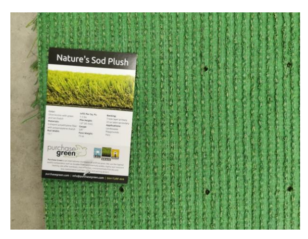
US00597 – Nature Sod Plush Turf backing view