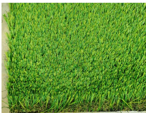
US00578 – Nature's Sod Platinum Turf face view