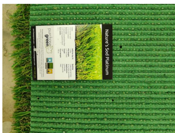
US00578 – Nature's Sod Platinum Turf backing view