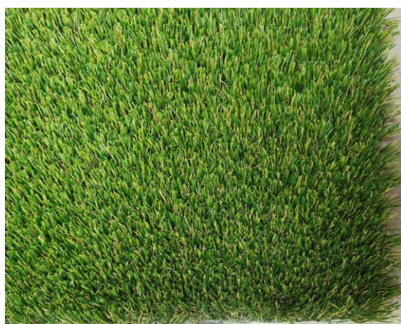
US00572 – Natural Fusion Olive face view