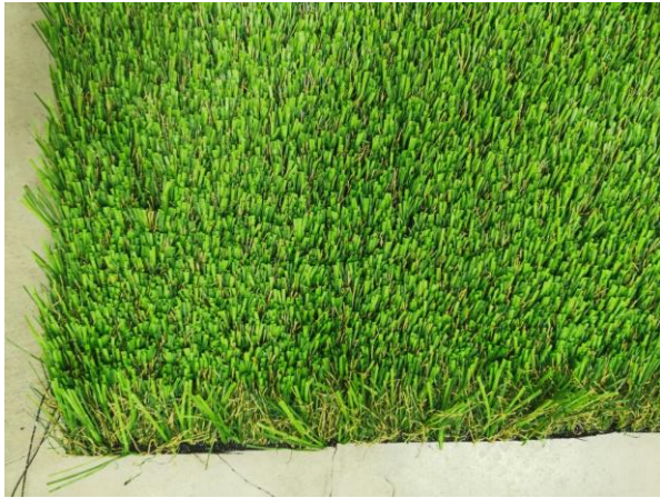
US00595 – Natural Fusion 80 Turf face view