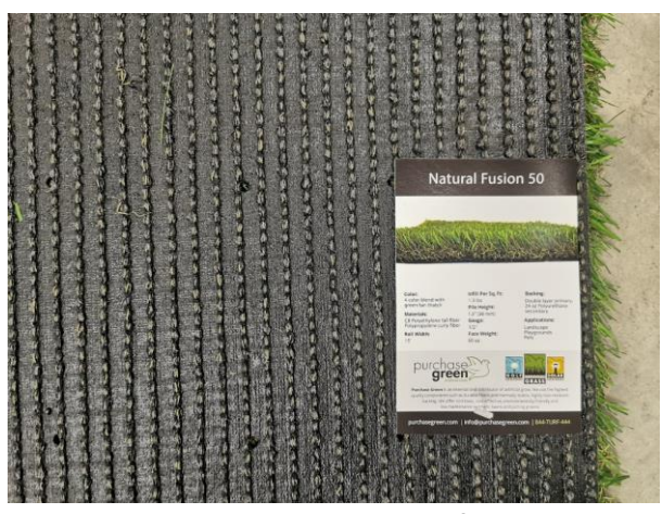
US00596 – Natural Fusion 50 Turf backing view