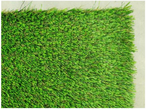
US00596 - Natural Fusion 50 Turf face view