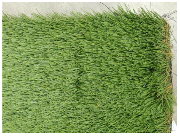
US00588 – Fescue Supreme Turf face view