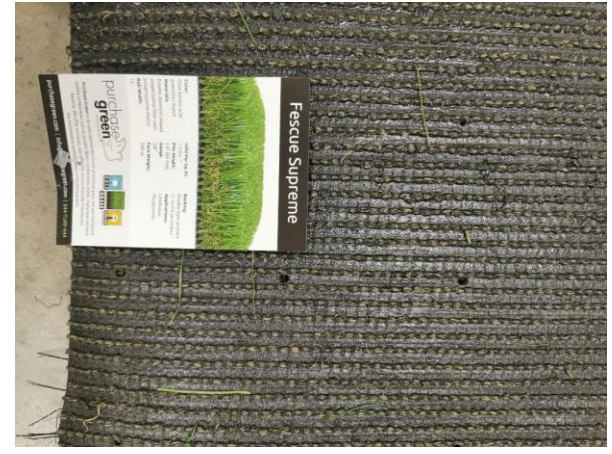
US00588 – Fescue Supreme Turf backing view